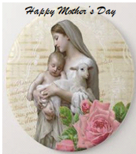
Happy Mother's Day

Please do not leave clothing or shoe donations in the church.