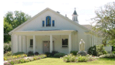
St. Theresa, The Little Flower Church 17 Still River Road, Harvard, MA