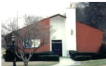
St. Francis Xavier Church 808 Main Street, Bolton, MA